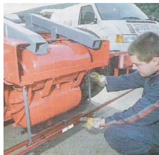
Bars with measuring gauges fitted front to rear