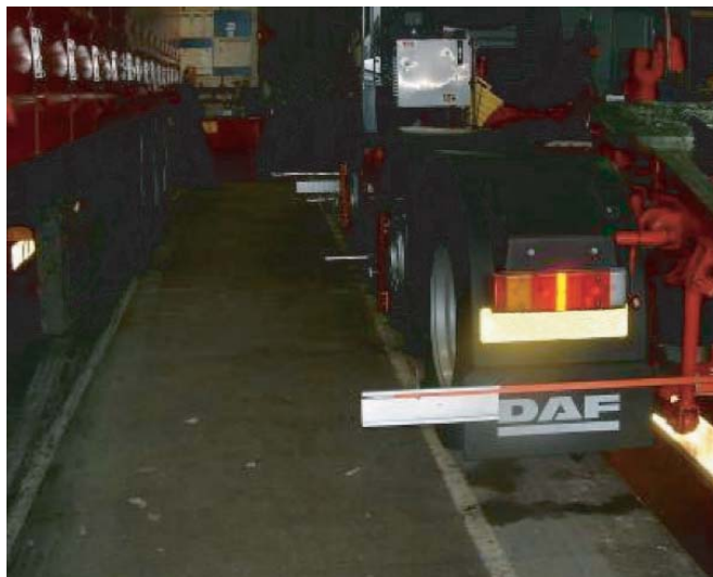
Tractor unit undergoing wheel alignment

However, owing to the sensitivity of the laser wheel alignment process, the fault was identified and rectified. The fault was found to be that the nearside front wheel was misaligned. Following positive results at this depot the company now puts all of its vehicles through wheel alignment at every pre-MoT inspection at all 20 depots.