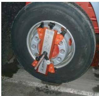
Laser light devices fitted to each wheel

The process of laser wheel alignment involves fitting the vehicle at the front and rear with bars with measuring gauges attached. Devices are then fitted to each wheel, complete with laser lights. These laser lights on each wheel are lined up with the gauges on the front and rear bars, to measure the amount of 'toe in' and 'toe out' of each wheel. Having taken these measurements, simple adjustments can be made and wheel realignment achieved. Figure 2 illustrates the procedure.