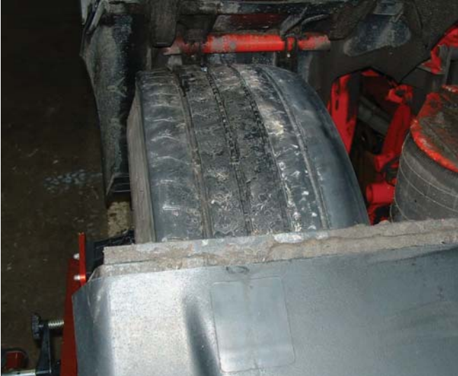
Uneven tyre wear due to misalignment

The tyre in this photograph has completed 220,000 kms and shows some uneven wear due to misalignment. However, if action is taken to rectify the problem then the expected life could be extended to over 300,000 kms.