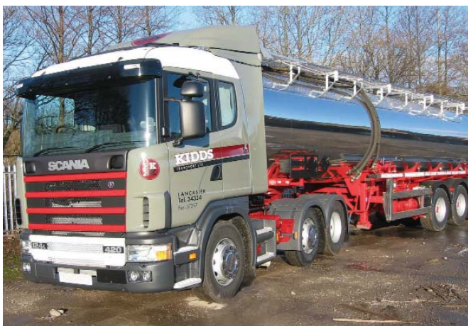
Kidds Transport 6 axle articulated tanker

Kidds Transport is a Lancaster-based company employing 30 drivers and runs a 12-hour operation from Monday to Friday.