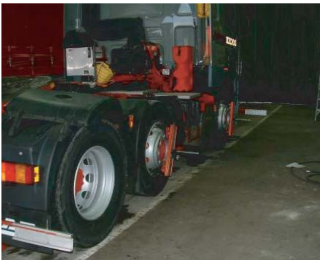
Wheel alignment using laser technology

The following case studies of Kidds Transport and Co-operative Retail Logistic (CRL) Distribution provide information on how each company has benefited from incorporating laser wheel alignment into their preventive maintenance programmes.