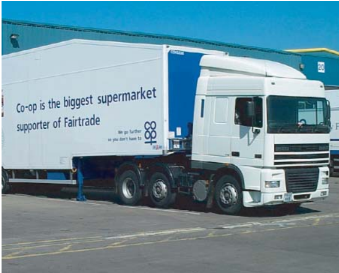
CRL Distribution 6 axle articulated box

CRL Distribution delivers fresh, chilled and frozen foods to Co-op retail outlets. One of its key Northern depots is at Ossett, near Wakefield, West Yorkshire. This depot operates 24 hours per day, delivering mainly along the M62 corridor between Manchester and Hull.